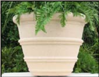
Planters & Fountains